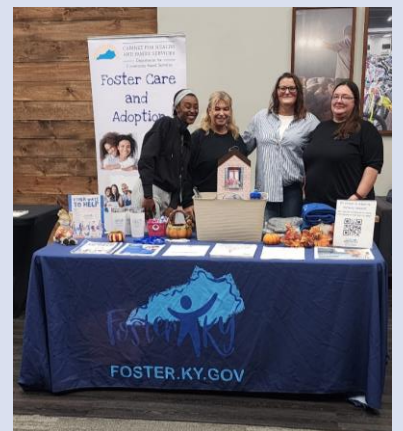
Northern Bluegrass Impact Screening hosted at Crossroads Church.