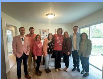
Warren County foster families and staff who helped in several areas of the Foster House