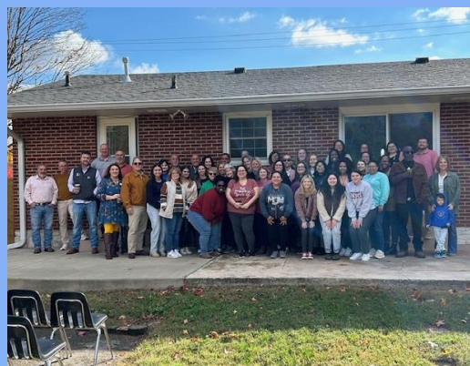
Warren County P&P staff, contractors, business leaders and foster families who were present for the dedication.

Read the full article here: Foster House Article